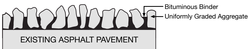
Cross-section of a one-size seal coat aggregate

The two most common varieties of chip seal applications are the single chip and double chip. We recommend using our specially blended polymer emulsion if the pavement surface is severely distressed.